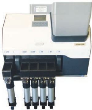
Machine setup with wrapping attachments