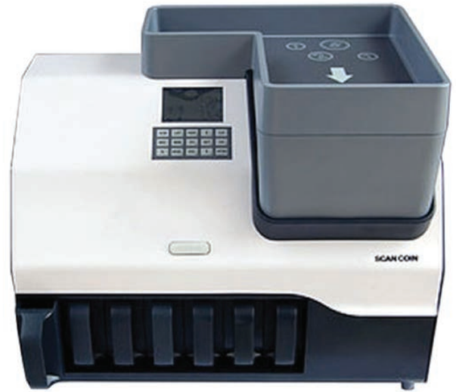
Machine setup with coin drawers

Plug and play interface to Websafe™ cash management solution